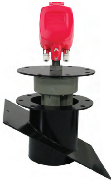
Scanner with flat mounting plate inserts through 30° mounting plate