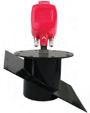
Assembled flat and 30° mounting plates